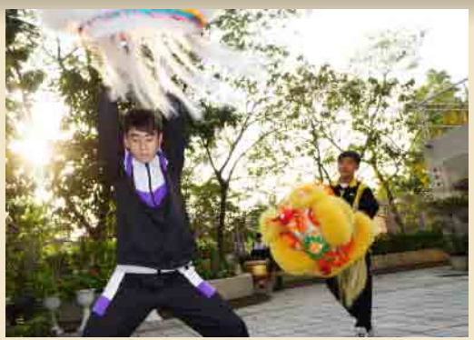
Lion Dance Club