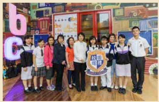
DBC Digital Radio sharing