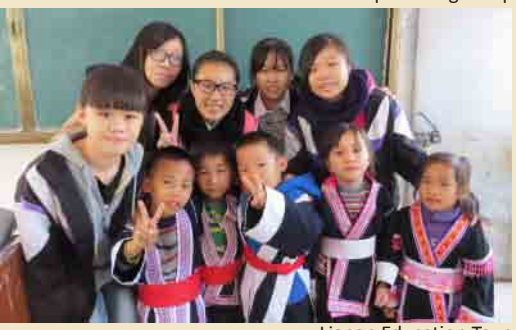
Lianan Education Tou