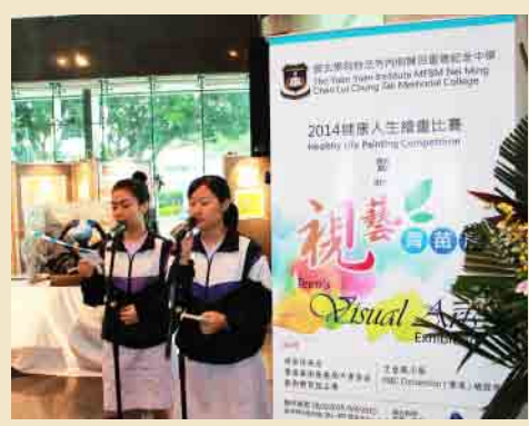
Opening Ceremony MC