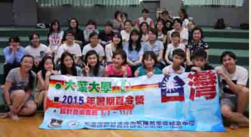
Xian Education Tour Taiwan Education Tour