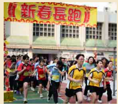
New Year Run